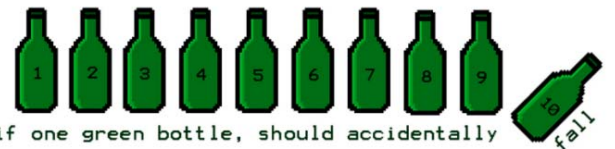
if one green bottle, should accidentally